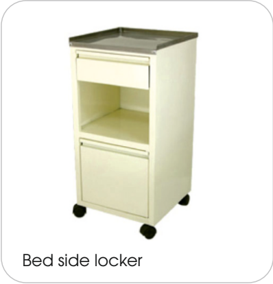
Bed side locker