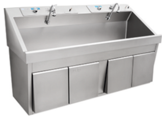
Hand scrub unit