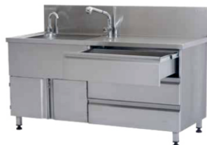
Baby washing bench