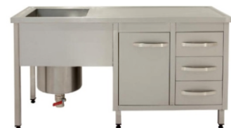
Plaster preparation table