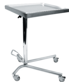
Hydraulic mayo table