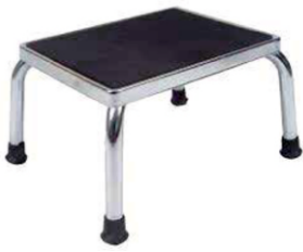
Foot step single