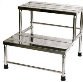
Foot step double