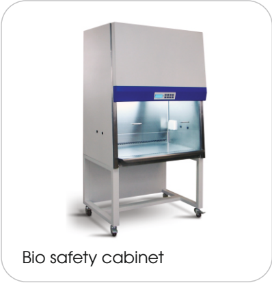
Bio safety cabinet