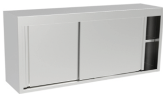
Cupboard wall mount