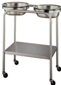
Bowl stand with table