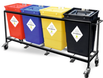
Waste carrying trolley