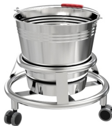
Movable waste bin